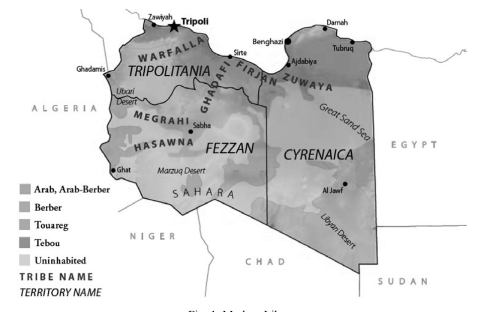
Fig. 1. Modern Libya

general elections (1952) and re-established religious lodges ( zuwaya ). We must bear in mind that the traditional social structure in Libya is profoundly defined by tribalism . The country has about 140 influential tribes and clans but only about two dozen wield socio-political authority and vie for power. This tribalism is geographically based (e.g. the biggest tribe – Warfalla in Tripolitania – amounts to nearly 1 million). The modern shape of Libya's basic ethnic characteristics is presented below (see Figure 1). This led to a culture of tribal patronage driven by oil wealth after the latter was discovered in 1959. The monarchy entered Libya onto the road to political exclusion of its citizens and obstruction of local state-building and modernisation. It was described by Dirk Vanderwalle as an "accidental state" <sup>12</sup>