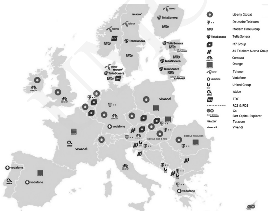
Figure 1. Pay AV services by ownership, geography segmentation (2017)

Figure 1 shows how closely the markets in each Member State are interconnected through the largest service providers. It is clear that most consumers in the Member States are fighting for the majority of consumers, that means that in most cases we can talk about limited competition.