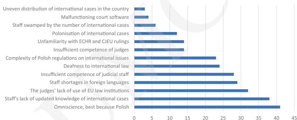
Figure 3. Main problems of Polish courts in international elements by lawyers surveyed (aggregated number of indications in interviews)

The lawyers who participated in the survey, drawing on their extensive experience within the judicial system, compiled a comprehensive catalogue identifying a range of issues perceived in Polish courts, particularly among court staff and judges, regarding the application of international and European Union law in routine judicial proceedings. The insights provided by these legal practitioners uncover a pervasive array of problems and deficiencies within the framework of the Polish judiciary.