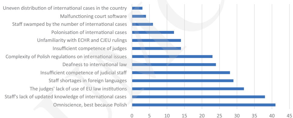
Figure 3. Main problems of Polish courts in international elements by lawyers surveyed (aggregated number of indications in interviews)

The lawyers who participated in the survey, drawing on their extensive experience within the judicial system, compiled a comprehensive catalogue identifying a range of issues perceived in Polish courts, particularly among court staff and judges, regarding the application of international and European Union law in routine judicial proceedings. The insights provided by these legal practitioners uncover a pervasive array of problems and deficiencies within the framework of the Polish judiciary.