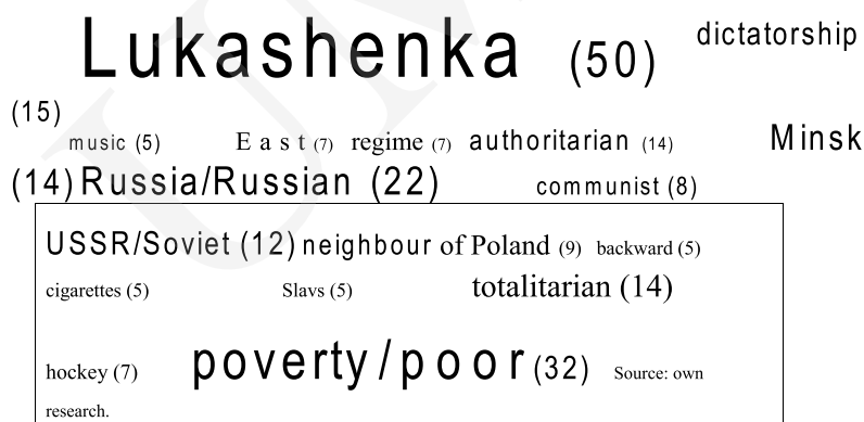
Fig. 2. The list of the top associations with Belarus and/or Belarusians provided by Polish university students. Larger fonts indicate that the association appeared more often. The numbers in brackets indicate how many respondents associated this word with Belarus and/or Belarusians

Answering the questions „Please enter the three main words or phrases, which you associate with Belarus and/or Belarusians” the majority of respondents wrote several words or phrases. In total, respondents provided a lot of associations – 172 different words and phrases were mentioned 25 . However, the majority of words were repeated just once and only a few of them were repeated systematically. The most frequently occurring association – Lukashenka , was written by 50 students, which is still quite a low number (35 per cent of the total amount of respondents). Poverty and Russia/Russian were mentioned respectively by 32 students (13 per cent) and 22 students (15 per cent). The other main associations: dictatorship , authoritarian , Minsk , USSR/Soviet were repeated ten to twenty times (14 to 7 per cent). Thus, respondents provided surprisingly few associations with Belarusians . Moreover, all of the main associations concerned the politics or economy of the state, while the culture, people, their national characteristics and mentality were neglected. That confirms the results of the previous studies, stating that Belarusians still remain almost unknown and do not evoke many associations among Poles. The list of top associations is shown in Figure 2.