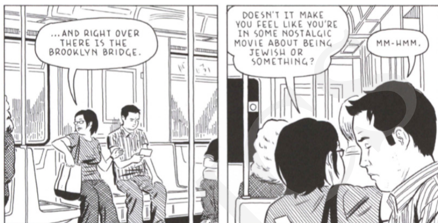
Fig 20. Tomine A. (2012). Shortcomings . London: Faber and Faber, p. 79.

A similar reference is also made by Kim, when she reflects on living in New York: