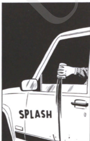
Fig 10. Tomine, A. (2012). Shortcomings . London: Faber and Faber, p. 37.