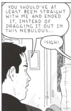
Fig 3. Tomine, A. (2012). Shortcomings . London: Faber and Faber, p. 100.

Motion lines are scarce and subtle and appear usually when Ben slams the phone or throws something on the ground: