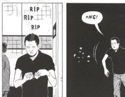
Fig 4. Tomine, A. (2012) Shortcomings . London: Faber and Faber, p. 104.

Motion lines are scarce and subtle and appear usually when Ben slams the phone or throws something on the ground: