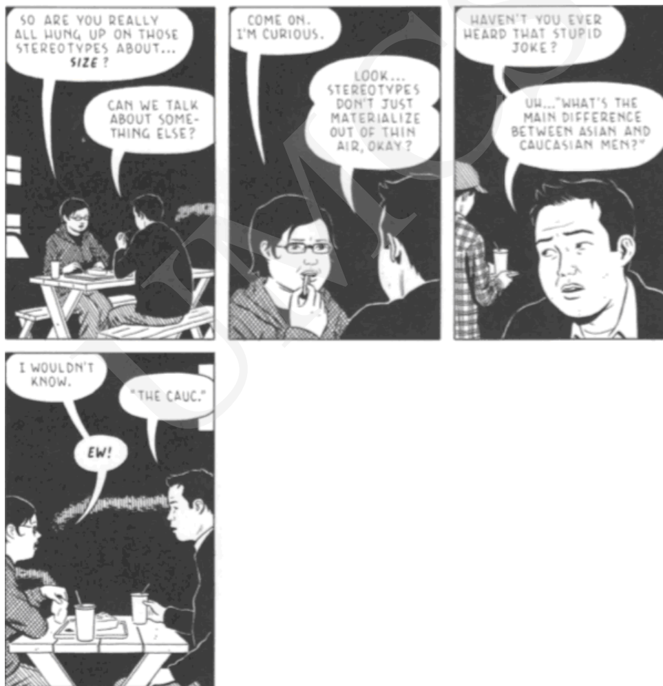
Fig 26. Tomine A. (2012). Shortcomings . London: Faber and Faber, p. 57.