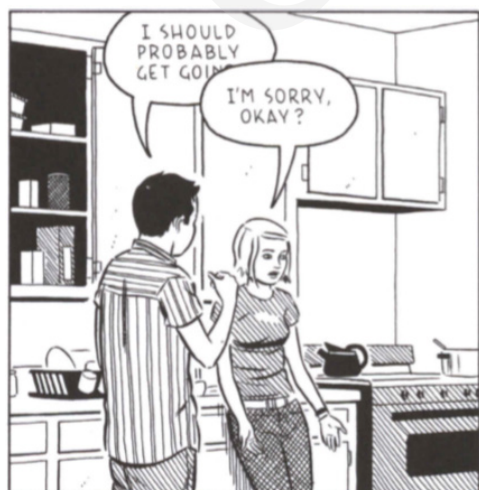
Fig 14. Tomine, A. (2012). Shortcomings . London: Faber and Faber, p. 50.

This convention was maintained in all cases but one: