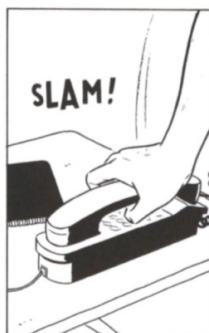
Fig 5. Tomine, A. (2012). Shortcomings . London: Faber and Faber, p. 73.