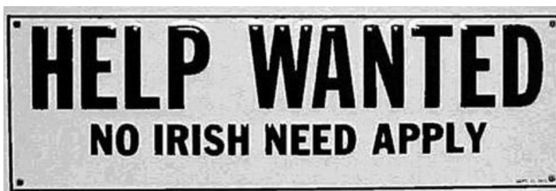
Figure 4. The so-called NINA sign

Source: Dooley, Michael. "Editorial Cartoonist Thomas Nast: Anti-Irish, Anti-Catholic Bigot?". 2017. Accessed June 14. http://www.victoriana.com/history/irish-political-cartoons.html .