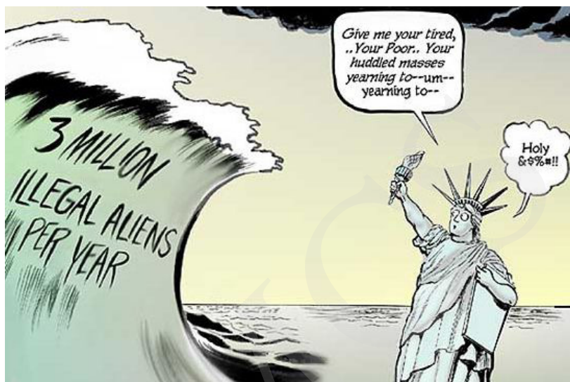
Figure 1. The alien tsunami that scares even the Lady Liberty (CNS News.com, 2010)

Source: E. Pluribus Unum. "Cartoons." 2017. Accessed June 10. https://epluribusunumjcom2010.wordpress.com/cartoons/ .