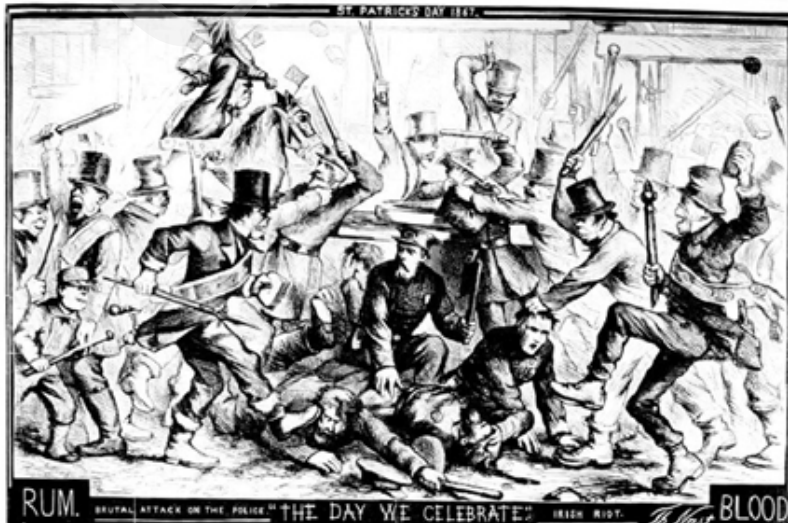
Figure 6. St. Patrick's celebration that turned into riot ( Harpers Weekly , 1867)