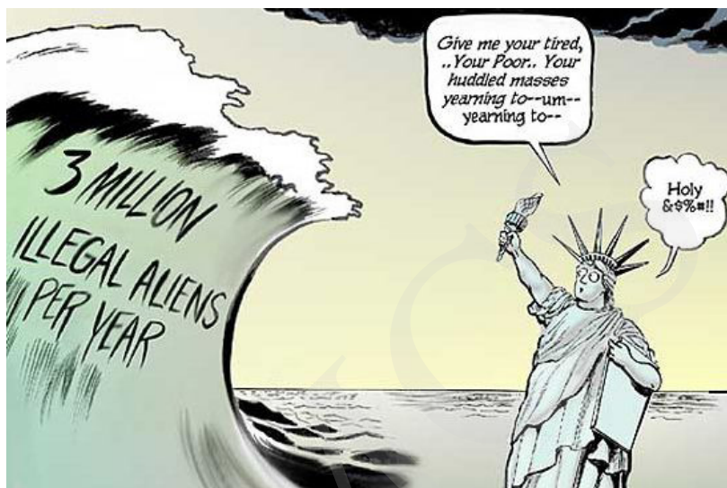
Figure 1. The alien tsunami that scares even the Lady Liberty (CNS News.com, 2010)