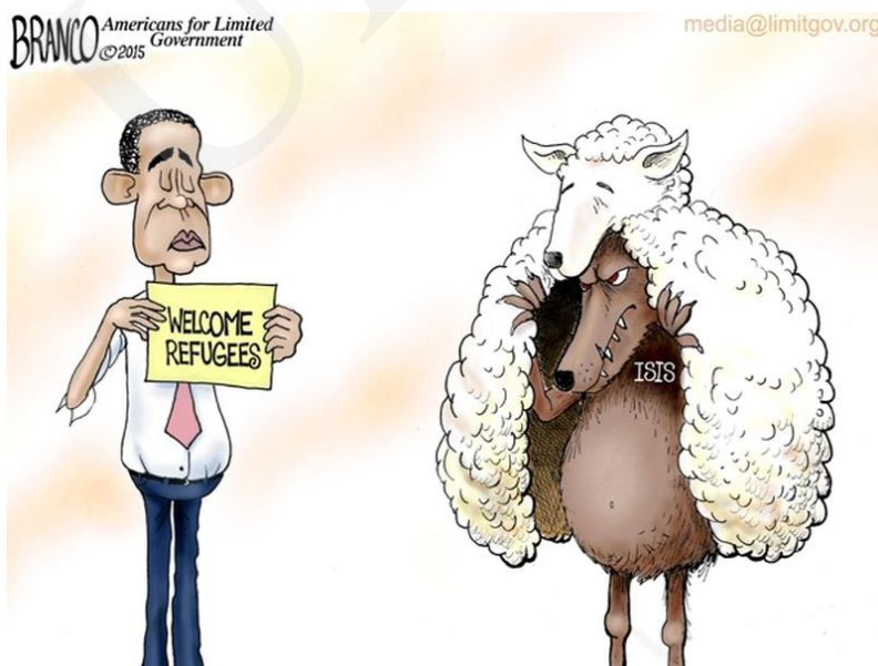
Figure 2. Representation of refugees as a lurking danger (ALG, 2015)