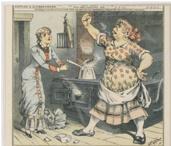
Figure 7. An overbearing Irish maid ( Puck , 1883)