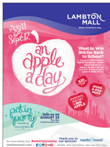
Figure 1a. Advertisement of the Lambton Mall ( http://click-sarnia.com/apple-day-lambton-mall-contest/ , retrieved 20 February 2016)

Moreover, modern advertising business relies heavily on the persuasive power of proverbs, frequently building its eye-catching slogans upon their structure. As an illustration, consider the advertisement by the Lambton Shopping Mall (Figure 1a).