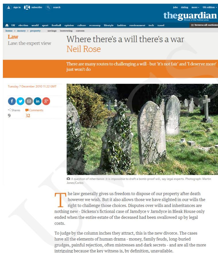
Figure 3. Fragment of the article “Where there’s a will there’s a war” from The Guardian ’s official website (available at http://www.theguardian.com/law/2010/dec/07/neil-rose-will-disputes ; retrieved March 23, 2015).