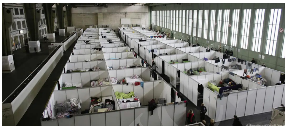
Picture: the refugee accommodation in the hangar of the airport Berlin Tempelhof, 2016 (source: Deutsche Welle)

https://www.dw.com/en/berlin-to-stop-housing-refugees-in-tempelhof-hangars-in-theory/a-19415068