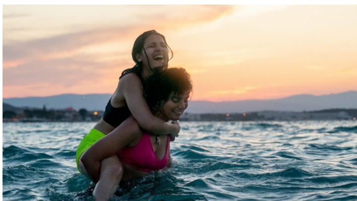
The Swimmers (2022), promotional picture for the movie

The movie The Swimmers (USA & UK, 2022) tells the real story of the teenage sisters Yusra and Sarah Mardini who fled their home in Syria due to the war. Dive into their inspiring story with our in-depth look at the movie and our survey on it. Discover how this powerful film is changing perspectives on the refugee crisis and resonating with audiences worldwide.