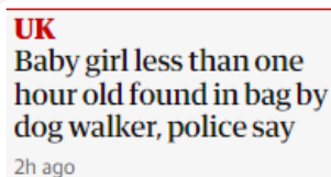
Figure 7. The Guardian, accessed on 19.01.2024

The parameters of newsworthiness present in this newsbite are enacted through emotivity as reels under carries a personalizing connotation. Moreover, the claim It's the work of... expresses certainty, which refers to the parameter of reliability that is connected to epistemic modality or modalization in systemic functional linguistics.