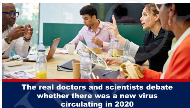
Figure 9. The Exposé, accessed on 19.01.2024.

The accompanying image includes what seems to be a representation of the vaccine and a syringe against a backdrop of what might be virus as well as a human heart. The use of the heart image alongside a sharp medical instrument, such as syringe, may elicit an emotional response concerning health and mortality, which are critical issues that affect everyone. Based on that it is to be assumed that the function of the image is evaluation, and the relationship between the image and text appears to be overlap, as the meaning is expressed metonymically.