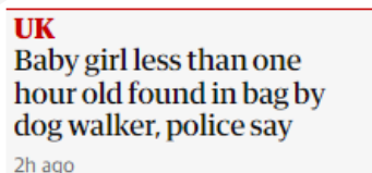
Figure 7. The Guardian, accessed on 19.01.2024

The parameters of newsworthiness present in this newsbite are enacted through emotivity as reels under carries a personalizing connotation. Moreover, the claim It's the work of... expresses certainty, which refers to the parameter of reliability that is connected to epistemic modality or modalization in systemic functional linguistics.