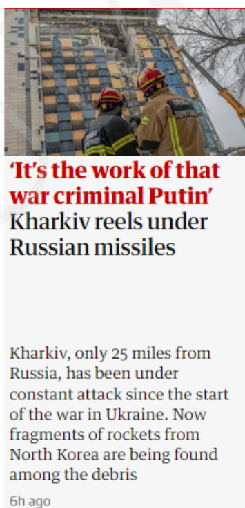
Figure 6. The Guardian, accessed on 19.01.2024

As for the parameters of newsworthiness, the parameters of reliability or evidentiality are the most prominent as the reporting verb says suggests that there is little to no evidence to back up what happened in Pakistan. Simply put, “Iran violated Pakistan’s airspace, killing two children” sounds more definite, as opposed to the original statement.