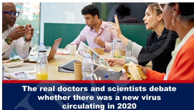
Figure 9. The Exposé, accessed on 19.01.2024.

The accompanying image includes what seems to be a representation of the vaccine and a syringe against a backdrop of what might be virus as well as a human heart. The use of the heart image alongside a sharp medical instrument, such as syringe, may elicit an emotional response concerning health and mortality, which are critical issues that affect everyone. Based on that it is to be assumed that the function of the image is evaluation, and the relationship between the image and text appears to be overlap, as the meaning is expressed metonymically.