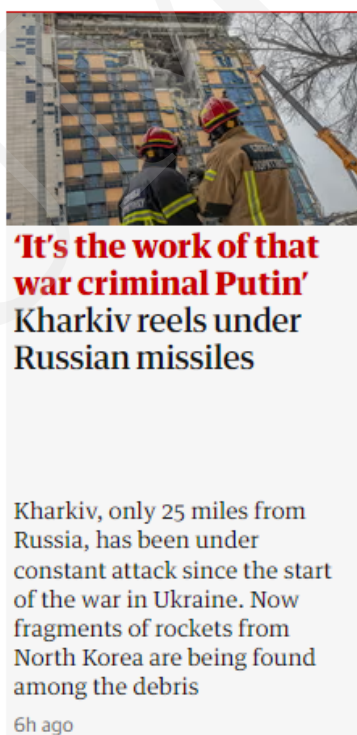
Figure 6. The Guardian, accessed on 19.01.2024

As for the parameters of newsworthiness, the parameters of reliability or evidentiality are the most prominent as the reporting verb says suggests that there is little to no evidence to back up what happened in Pakistan. Simply put, “Iran violated Pakistan’s airspace, killing two children” sounds more definite, as opposed to the original statement.