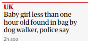
Figure 7. The Guardian, accessed on 19.01.2024

The parameters of newsworthiness present in this newsbite are enacted through emotivity as reels under carries a personalizing connotation. Moreover, the claim It's the work of... expresses certainty, which refers to the parameter of reliability that is connected to epistemic modality or modalization in systemic functional linguistics.