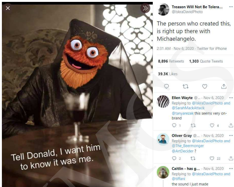
Fig. 3: Example of Gritty meme with high intertextuality by @IskraDavidPhoto (2020)

While the framing is similar to the previously discussed examples, in memes such as this 3 , several elements come together to create the multi-layered joke of the meme: Gritty's head is super-imposed on Olenna Tyrell, a character from HBO's Game of Thrones series. The show's quote is slightly altered to refer to Donald Trump, once again taking the place of a hated villain, this time Game of Thrones ' king Joffrey. Denisova (32) points out that "memes are coded messages and therefore can be confusing for various people: members of the audience may have varying abilities and skills to read the 'code'" in such cases. Here it is both necessary to know the context of the quotes – Olenna admitting to the murder of a tyrant king – and the event it references, with the implied metaphorical murder being Trump's loss of the election, which was attributed to the votes of leftist Philadelphians, as Pennsylvania flipping blue was seen as the key event cementing Biden's victory, metonymically referenced through Gritty.