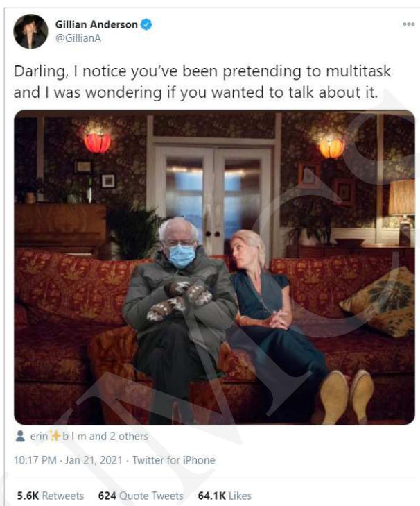
Fig. 6: Celebrities such as actress Gillian Anderson contributed to election memes spreading, sharing variations of “Bernie’s Mittens”

depicted as “cool” and culturally informed both in memes and ... fan writings” (2020) which are widely created and shared. This relatable image soon lost all political significance, becoming seemingly a floating signifier without clear meaning or reference. The iconic photograph of Bernie in his mittens was inserted into anything – from pop cultural imagery such as the Totoro meme 6 to the NASA rover landing – and reproduced in many media, be it deep faked video clips or as a crocheted doll.