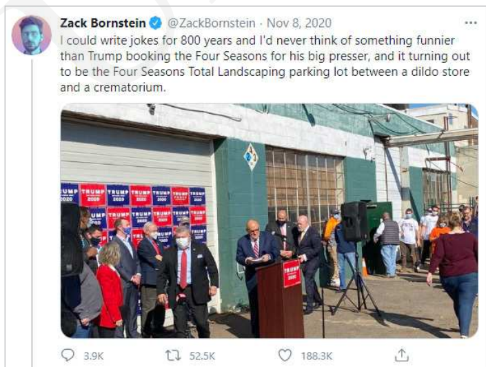
Fig. 4: A photograph of Trump’s press conference, commented on by @ZackBornstein

Another way Trump’s loss of the election was celebrated in meme-format occurred in the form of event references, such as the slow vote counting in Nevada (e.g. Haylock 2020) or in response to Trump’s final press conference. After it was announced that he would be giving a press conference not in the Four Seasons hotel but Four Seasons Total Landscaping parking lot, many memes were created that alluded to this event.