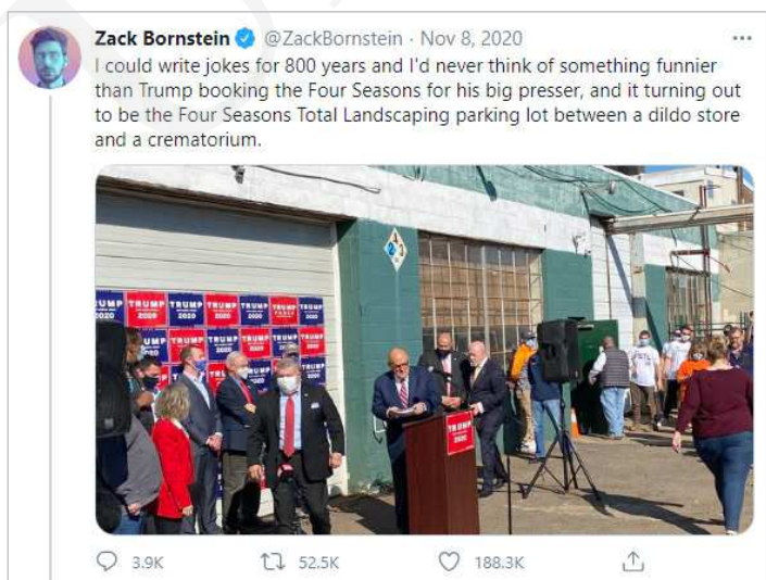
Fig. 4: A photograph of Trump’s press conference, commented on by @ZackBornstein

Another way Trump’s loss of the election was celebrated in meme-format occurred in the form of event references, such as the slow vote counting in Nevada (e.g. Haylock 2020) or in response to Trump’s final press conference. After it was announced that he would be giving a press conference not in the Four Seasons hotel but Four Seasons Total Landscaping parking lot, many memes were created that alluded to this event.