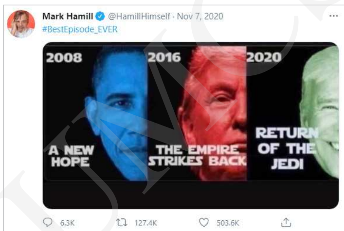
Fig. 2: The titles of the original Star Wars trilogy imposed on the American presidents from 2008 to 2020 (@HamillHimself, 2020).

Hence allusions to popular movies and TV shows form the base of many memes framing the weeks of the election week. Particularly references to such staples of geek fan culture as Star Wars , Marvel , and Game of Thrones were abundant, with even Mark Hamill, the actor playing Star Wars ' Luke Skywalker, sharing a highly popular meme after the election that was liked 500k times: