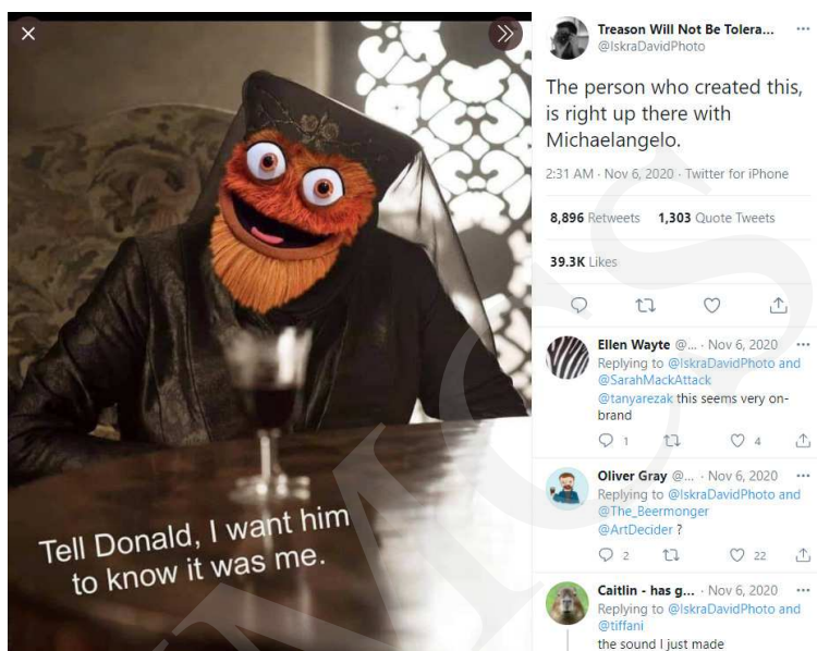
Fig. 3: Example of Gritty meme with high intertextuality by @IskraDavidPhoto (2020)

While the framing is similar to the previously discussed examples, in memes such as this 3 , several elements come together to create the multi-layered joke of the meme: Gritty's head is super-imposed on Olenna Tyrell, a character from HBO's Game of Thrones series. The show's quote is slightly altered to refer to Donald Trump, once again taking the place of a hated villain, this time Game of Thrones ' king Joffrey. Denisova (32) points out that "memes are coded messages and therefore can be confusing for various people: members of the audience may have varying abilities and skills to read the 'code'" in such cases. Here it is both necessary to know the context of the quotes – Olenna admitting to the murder of a tyrant king – and the event it references, with the implied metaphorical murder being Trump's loss of the election, which was attributed to the votes of leftist Philadelphians, as Pennsylvania flipping blue was seen as the key event cementing Biden's victory, metonymically referenced through Gritty.