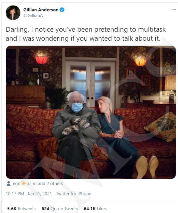
Fig. 6: Celebrities such as actress Gillian Anderson contributed to election memes spreading, sharing variations of “Bernie’s Mittens”

depicted as “cool” and culturally informed both in memes and ... fan writings” (2020) which are widely created and shared. This relatable image soon lost all political significance, becoming seemingly a floating signifier without clear meaning or reference. The iconic photograph of Bernie in his mittens was inserted into anything – from pop cultural imagery such as the Totoro meme 6 to the NASA rover landing – and reproduced in many media, be it deep faked video clips or as a crocheted doll.