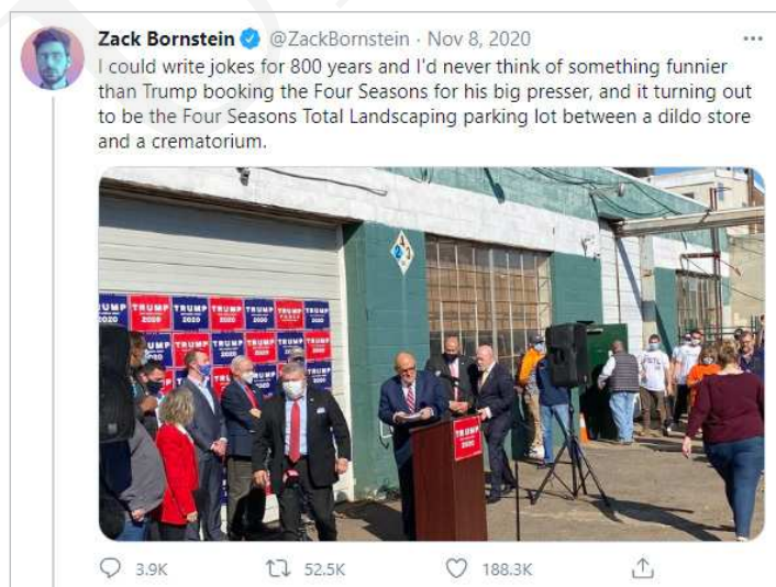
Fig. 4: A photograph of Trump’s press conference, commented on by @ZackBornstein

Another way Trump’s loss of the election was celebrated in meme-format occurred in the form of event references, such as the slow vote counting in Nevada (e.g. Haylock 2020) or in response to Trump’s final press conference. After it was announced that he would be giving a press conference not in the Four Seasons hotel but Four Seasons Total Landscaping parking lot, many memes were created that alluded to this event.