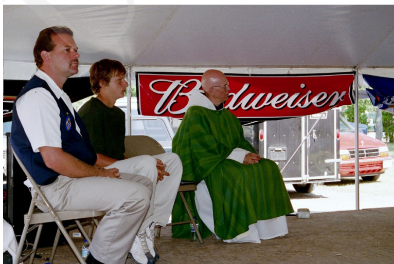
Figure 5. The Priest and Acolytes at Polka Mass, Pulaski Polka Days, 2004.

This shamelessness about Catholic Polish identity is a signal of great confidence in ethnic identity formation, if we recall that for more than a century “immigrant Catholicism or “ghetto Catholicism” was seen as “an obscurantist form of cult worship