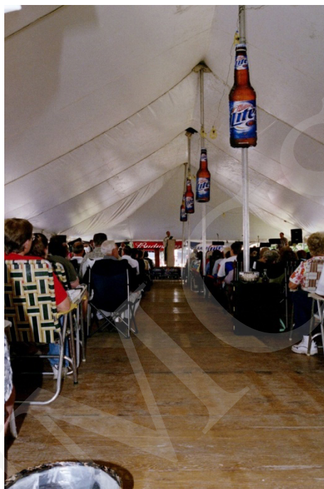
Figure 4. The Sacred and Profane merge at the Polka Mass, Pulaski Polka Days, 2004.