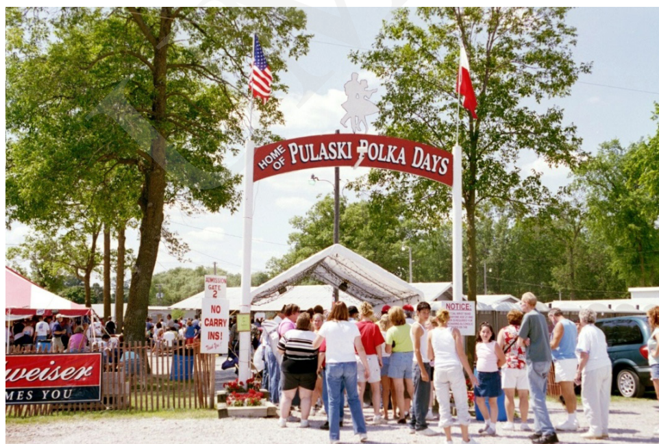
Figure 1. Entering the “neighborhood” at Pulaski Polka Days, 2004.

Recent scholarship on Polish American polka has argued that contrary to popular stereotype, polka is innovative hybrid alternative music and, furthermore, that preserving polka's history is an important, but often overlooked, part of preserving American multicultural history (Gunkel 2006, 5 – 8). This project continues that research by providing this spatially-framed study of the phenomenon of the seasonal polka festival. Over a period of five years, I visited polka festivals in North America as a participant observer, documenting the social and cultural landscape of these gatherings of polka people. This essay traces the nature of imagined community in Polish American polka festivals—understood as a diasporic ethnoscape--exploring the construction of ethnic space in the twenty-first century.