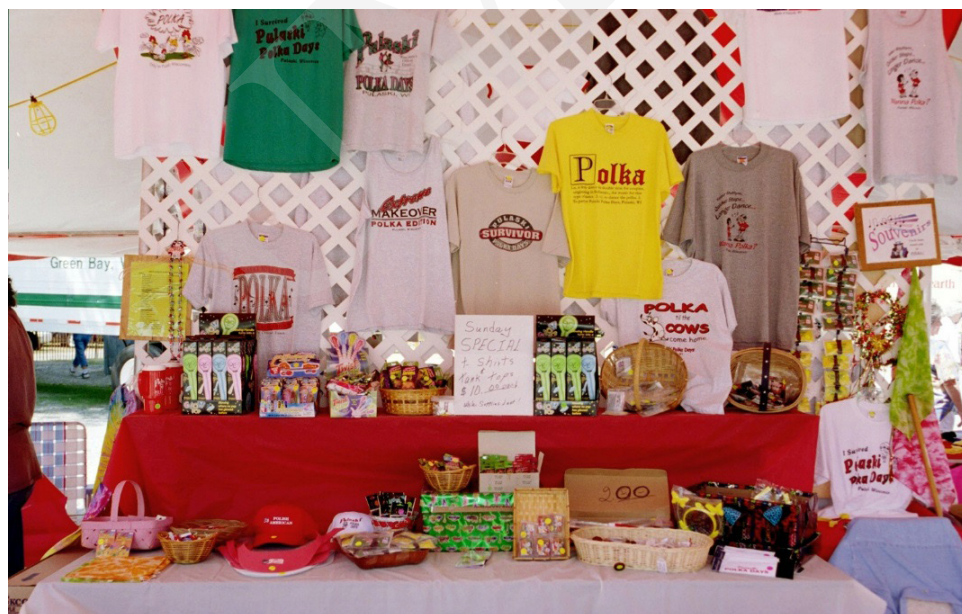
Figure 6. Souvenir Tent at Pulaski Polka Days, 2004.

This resilience is also seen in the polka community’s ability to sustain an independent polka economy, a community-based business alternative to the mainstream of corporate music production (Gunkel 2004, 414). [See Figure 6] In addition to the festivals and conventions, this economy includes polka recording studios, production and distribution, record and CD labels, polka record stores, polka Radio shows polka cruises and travel, polka internet sites, polka associations such as the IPA (International Polka Association) and UPA (United Polka Association), and polka publications. [See Figure7]