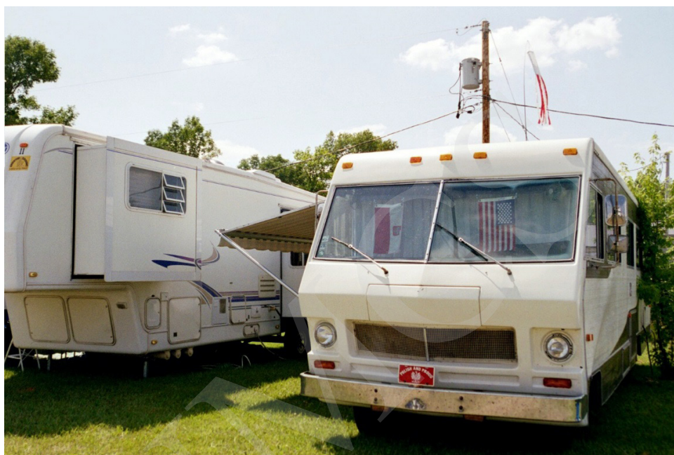
Figure 11. Mobile Home in the Ethnic “Neighborhood” displaying Polish American symbols.

In his critical work on cultural dimensions of globalization, Arjun Appadurai (1996) distinguishes between culture and the cultural. While culture is associated with a static conception of a people associated with specific traits, the cultural refers to situated differences, contrasts, and comparisons “that either express, or set the groundwork for, the mobilization of group identities” (13). Appadurai’s distinction expresses the fluidity of identity associated with diasporic movements. Describing complex repertoires of images, narratives, and ethnoscapes, he notes that ethnic images are diasporic. Appadurai recognizes the synergistic and serendipitous nature of the flow of representations. I would argue that this is the nature of the symbolic landscape from which Polish American polka people draw to fashion their group identity. In this landscape, symbols of farm prosperity, twentieth century nationalisms, hybrid music, Polish folk culture, and American ethnic urbanism all emerge as a field from which polka people craft their sense of identity and belonging. This sense of Polish American identity is formed in the space of a mobile community of polka music fans who recreate a movable Polish American “neighborhood” on the festival circuit.