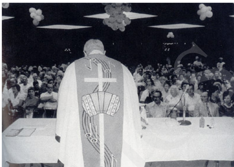
Figure 3. Priestly vestments at the International Polka Association's Polka Mass, 1983.