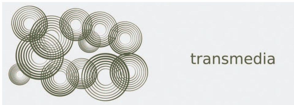
Figure 4. Transmedia to create own world

Zooming out from the landscape of new media pond, transmedia requires the widest-angle lens (Figure 4). Transmedia contribute to the creation of a new world resulting in complex networks of meanings and symbols via various atomic and crossmedia.