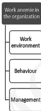
Fig. 4. The Model of the Three Forces of Employee Anomie