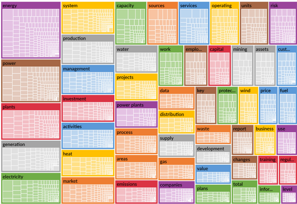
Figure 1. Hierarchy Chart – compared according to the amount of coding references (reports: ENA, PGE, TPE, ZEP)