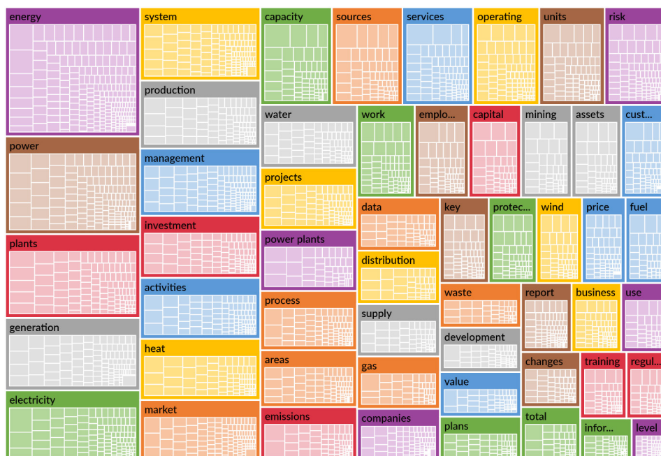
Figure 1. Hierarchy Chart – compared according to the amount of coding references (reports: ENA, PGE, TPE, ZEP)