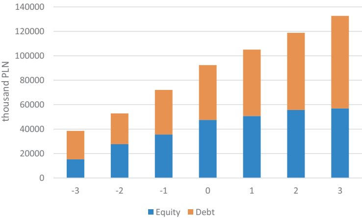
Figure 1. The size of equity and debt in years -3 to +3