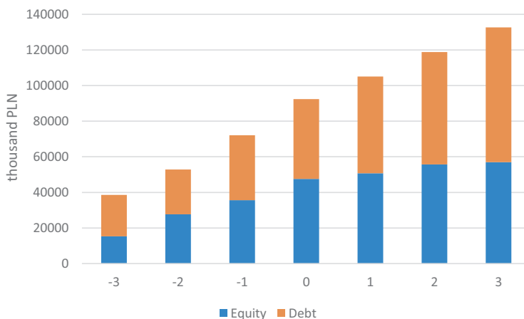
Figure 1. The size of equity and debt in years -3 to +3