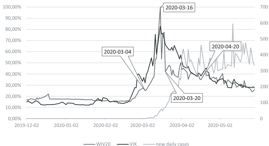
Figure 1. WIV20 and VIX indexes (a proxy of fear) and new daily cases of COVID-19 infection in Poland

Figure 1 presents the WIV20 and VIX indexes and new daily cases of COVID-19 infection in Poland during the period analyzed. This shows the relation between epidemic growth in Poland and increasing fear in the local and global context.