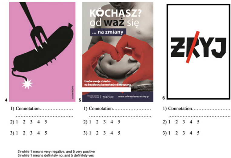
Figure 2. Focus group interview, connotation test form for the participants (p. 2)

Note: Translation of text from poster No. 5: “If you love, dare to change”. Make an appointment for a free dietary consultation for your child. 1 Translation of text from poster No. 6: “Live / Devour”. 2