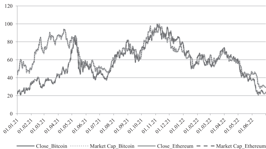
Figure 3. Standardized time series of Bitcoin and Ethereum quotations by Close and Market Cap categories in the period January 2021 – June 2022