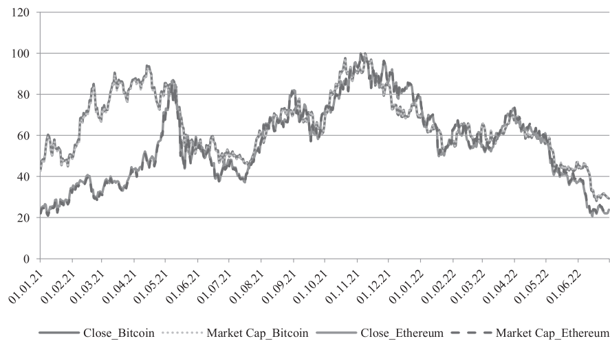
Figure 3. Standardized time series of Bitcoin and Ethereum quotations by Close and Market Cap categories in the period January 2021 – June 2022