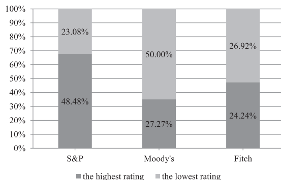
Figure 3. The highest and the lowest rating awarded by agencies

Furthermore, the analysis of the ratings awarded to the issuers by individual agencies was carried out, in order to check which agency gave the highest and the lowest credit ratings. For this purpose, the issuers which received the ratings from two or three agencies were analyzed. The issuers which received the rating only from one agency were excluded from this sample. The analysis does not also include the situations where the assessment of the agencies was the same.