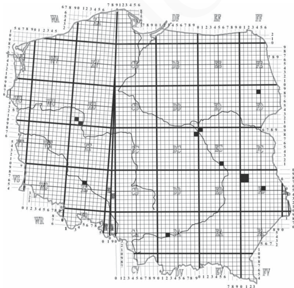
Fig. 4. Distribution of Uloborus plumipes in Poland.

First time recorded from Poland in 2001 from Białystok (101). Since 2002, this species was collected and observed in a number of localities in Lublin, and in several other Polish cities (87). Bigger populations which occur in large garden centers in Lublin may be described as semiautochthonic. They are formed by individuals reproducing partially in place, but these populations are still supplied with a number of specimens coming from almost every transportation of ornamental