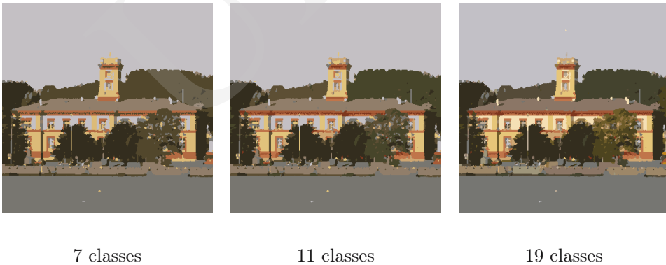
FIG. 5. Segmentations of building_1 test image chosen based on the F and Q function values. The following parameters were used during the over-segmentation – clustering method: CLINK , watershed attributes: average and variance , standardization: none .

factor in the assessment function increases, but the colour error does not significantly decrease.