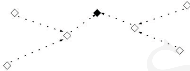
Fig. 1. The example of tree-based network.