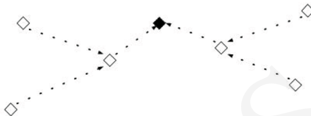
Fig. 1. The example of tree-based network.