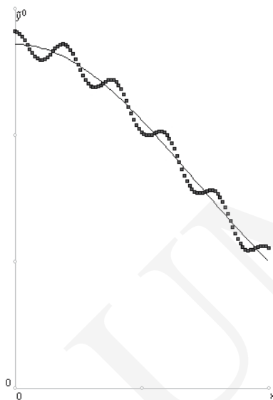
Fig. 2. The exact solution and \tilde{y}_i^0 for l = 2, T = 1, \beta_0 = 0.5, E_S = 10^{-1}, h_i^0 = 0.02.