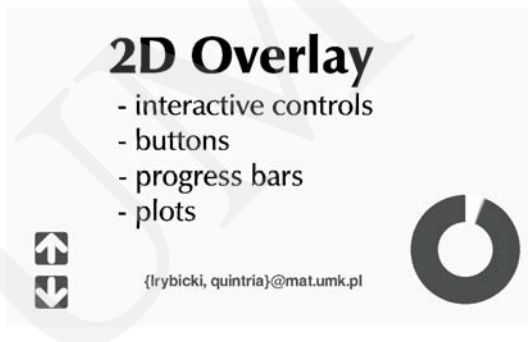
Fig. 4. Presentation of the 2D Overlay: two buttons, a static label and a circular progress gauge to-gether with a slide exhibit.

up.onClick = &display.camera.forward ; down.onClick = &display.camera.back ;