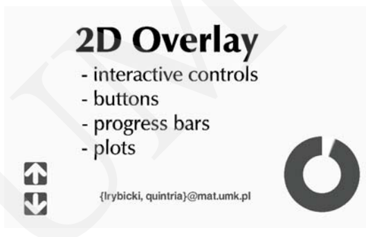
Fig. 4. Presentation of the 2D Overlay: two buttons, a static label and a circular progress gauge to-gether with a slide exhibit.

up.onClick = &display.camera.forward ; down.onClick = &display.camera.back ;