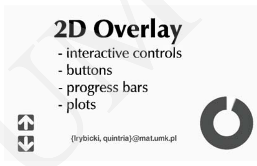
Fig. 4. Presentation of the 2D Overlay: two buttons, a static label and a circular progress gauge to-gether with a slide exhibit.

up.onClick = &display.camera.forward; down.onClick = &display.camera.back;