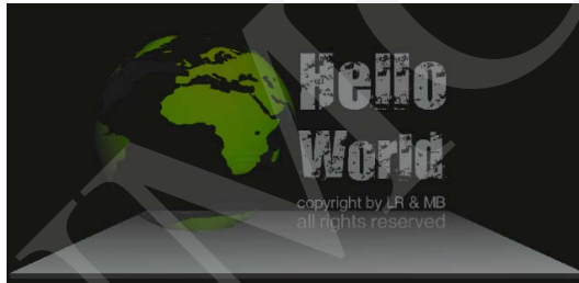
Fig. 5. A complex exhibit with an animated rotating object and a column of text labels.

The above line creates a Slide exhibit, which will contain a title and a bullet list in a column. The Slide constructor creates Label objects out of the string constants and determines their size. The title will be automatically resized to take up the whole exhibit width and the bullets in the list will be resized to have the same font size.