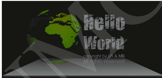
Fig. 5. A complex exhibit with an animated rotating object and a column of text labels.

The above line creates a Slide exhibit, which will contain a title and a bullet list in a column. The Slide constructor creates Label objects out of the string constants and determines their size. The title will be automatically resized to take up the whole exhibit width and the bullets in the list will be resized to have the same font size.