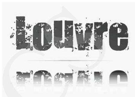
Fig. 1. The project logo as an exhibit.