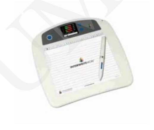
Fig. 2. Wireless tablet Interwite Mobi produced by Interwrite Learning.

The teacher's tablet provides a full, though discreet control over students' work. Due to the fact that the teacher can see answers entered by students on the display, s/he can assess the results immediately upon completing the task and discuss errors with particular students.