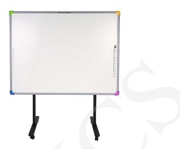
Fig. 1. An interactive whiteboard - Interwrite DualBoard.