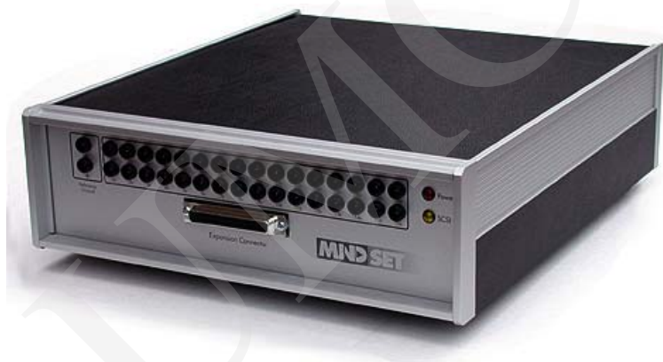
Fig. 1. Mindset MS-1000 EEG System.

MindSet MS 1000, manufactured by Nolan Computer Systems, is used as the hardware source of an EEG signal (Fig. 1). It is a real-time device containing a 16-channel analogue differential amplifier which receives signals from cap electrodes and amplifies them 32000 times. An amplified analogue signal is converted into a digital one as it goes through sample-and-hold circuits and an analogue-to-digital converter. Inside the device, there is a 32kB RAM buffer enabling it to withstand arrhythmical cooperation with a PC [9].