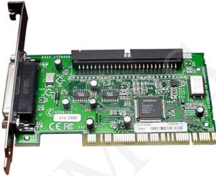
Fig. 2. Adaptec AHA 2906 controller.

For practical reasons (good quality development tools and documentation without restrictive license limits), our work is carried out in the GNU/Linux operation system environment with the application of a gcc compiler.