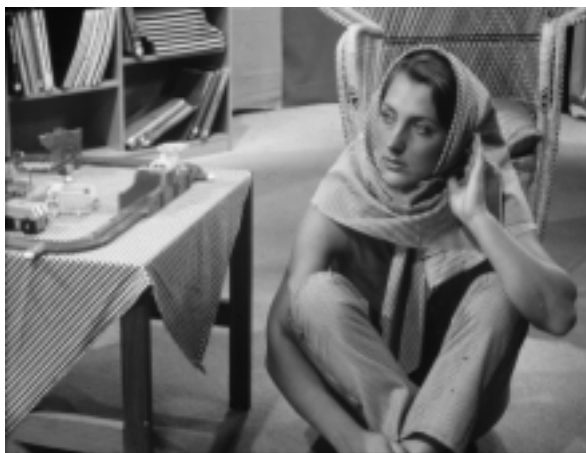
Fig. 1. Test image (“Barbara”) used in experiments

In the further parts of the paper we show the main principles of 2DKLT together with the three application areas: image compression, image scrambling and information embedding. All the experiments have been performed on the standard benchmark images. The image “Barbara” (8-bit gray-scale, 640×480 pixels) shown in Fig. 1 is employed in all cases as an example, since it contains areas of different nature (i.e. smooth, detailed, edges, etc.) and a human face, on which any unusual artifacts can be perfectly observed.