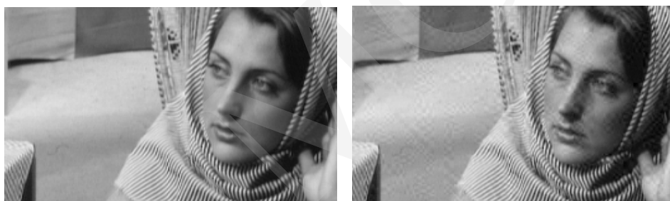
Fig. 5. Fragment of the original test image and its stegoed variant

KLT spectrum of its pixels. Hence, the message is being expanded into a longer sequence of small values e.g. binary ones. Then we have to generate a key which will determine where in the transformed blocks the elements of expanded message have to be placed. The key is a sequence of offsets from the origin of each block. It is important to place the message into the “middle-frequency” part of each block as a compromise between output image quality and robustness to intentional manipulations. This rule is especially significant in the case of images containing a large number of small details, which helps keep all the changes imperceptible. The only noticeable difference can be observed in the areas of uniform color. As an example of the embedding, the following image is presented (see Fig. 5).