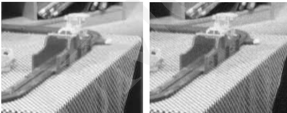
Fig. 3. Enlarged fragment of the test image compressed using the DCT-based (JPEG/JFIF) and 2DKLT-based algorithms

Figure 3 shows a comparison of the two compression methods: DCT-based (on the left) and 2DKLT-based (on the right). Enlarged fragment of the test image shows that the 2DKLT-based compression gives much more details reducing blurring of individual blocks. It is a result of optimal adaptation of basis functions for this specific image.