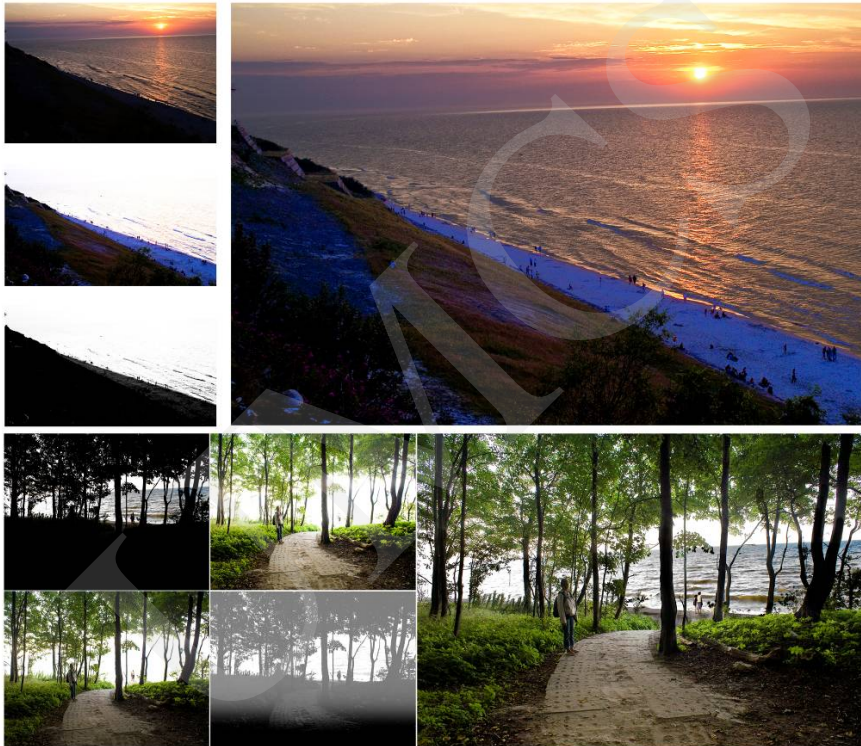
Fig. 4. Multiexposed Image Fusion example sets. Small images are part of the original multiexposed image set; the last small, blurred image is the Height Map; the large, color image is the fused image

images on the basis of the mask values. The reconstructed images are shown in Fig 4. and the numerical differences between these two methods are shown in Table 1.