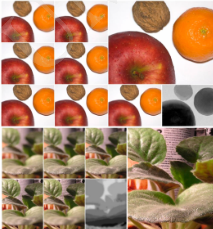
Fig. 3. Multifocus Image Fusion example sets. Small images are part of the original multifocus image set; last small, blurred image is the Height Map; large image is the fused image