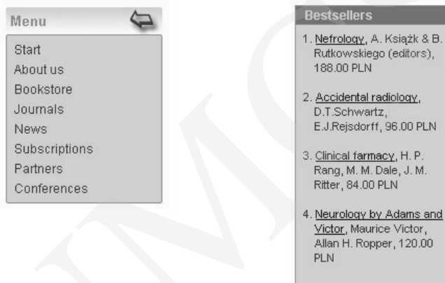
Fig. 2. The exemplary bricklets with different Decorator pattern applied

The documents set model allows to present content of some set as a bricklet [4]. The bricklet usually contains a list of documents or links placed in a given set. Depending on the renderer assigned to a certain set, the content of this set can be also rendered as an image with a name of document. If some options are set, the renderer also allows to display some additional metadata that describe the document. Nevertheless, the renderer is responsible only for the content visualization.