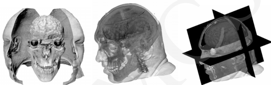
Fig. 3. Three-dimensional visualization techniques: (from left) surface rendering, combination of volume and surface rendering, 3D-slices combined with surface rendering

been performed on a PC system (Athlon XP 3200+ 2.2 GHz, 512 MB RAM). The matching process of the MRI and RGB datasets using the mutual information measure and the Powell's optimization method took 20 minutes 41 seconds (two-step rigid and affine multi-resolution approach) and required 2531 evaluations of the mutual information objective function. In the second case (CT and RGB datasets) the total running time took 4 hours 50 minutes 4 seconds (two step multi-resolution approach) and the mutual information function has been evaluated 1735 times.