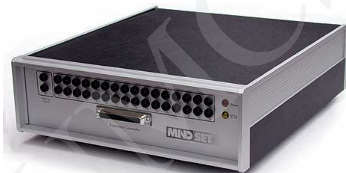
Fig. 1. Mindset MS-1000 EEG system

In the Division of Complex Systems and Neurodynamics the Mindset MS-1000 EEG System manufactured by Nolan Computer Systems is used [7] (Fig. 1). In terms of hardware it is a real-time device containing a 16-channel differential analog amplifier as the beginning of a signal trace. The amplifier gathers signals from electrodes placed on a special cap (Fig. 2) and amplifies them 32000 times. Next, the signal goes to an analog-to-digital converter. The Device contains 64kB RAM buffer for converted data which is also responsible for the device tolerance to the unrhythmic co-operation with the computer.