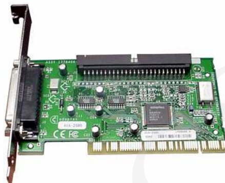
Fig. 3. Adaptec AVA 2906 controller

The devices are connected by means of a special multi-pin cable. In the original version, the data acquisition software was implemented for MicroSoft Windows OS. While using the driver delivered by Adaptec, data is acquired by the software produced by Nolan Computer Systems and can be immediately analysed, saved in a file and analysed from the file in offline mode.